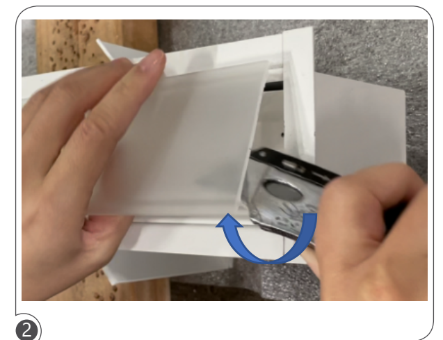
Then aim the blade towards the other leg of the same side to completely remove one side.

Insert blade and gently lift at an angle to remove one leg of the lens first.