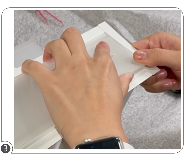
Skip the remaining 1/3 and go to the end of the fixture. Repeat #1.