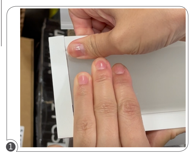
Snap in and insert one end with gentle force.