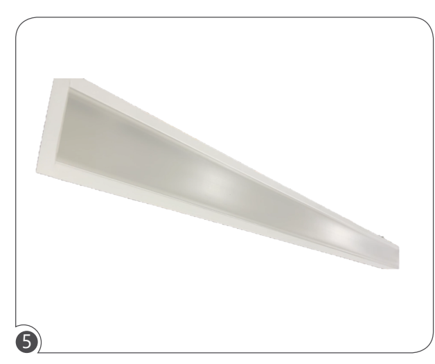
Make sure the lens is completely and properly installed all the way.