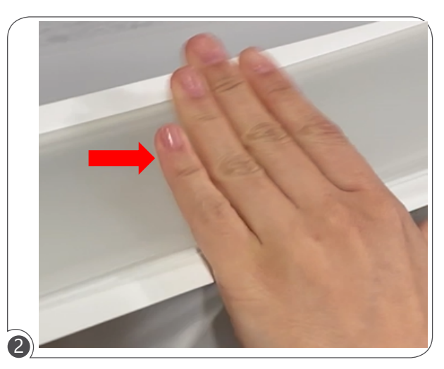
Run hands through the length until about 2/3 way and stop.