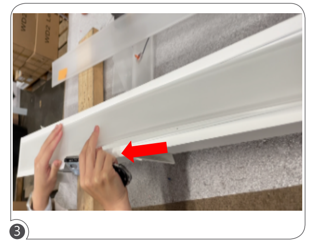
Gently lift up and work your way through the length up to about 2/3 way and stop.