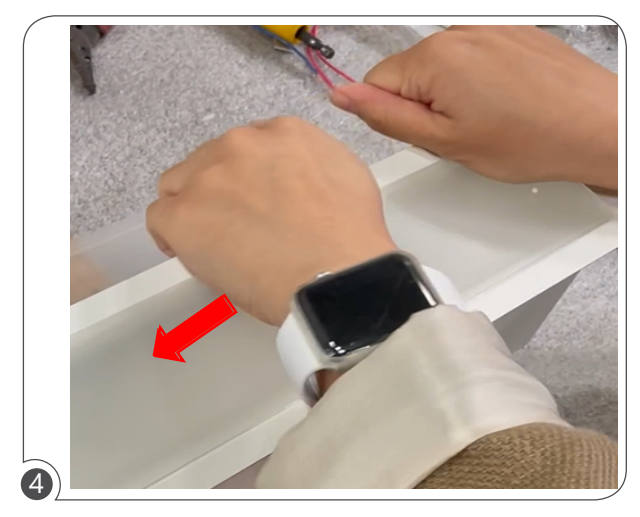
Run hands through the opposite direction to fully close the lens.